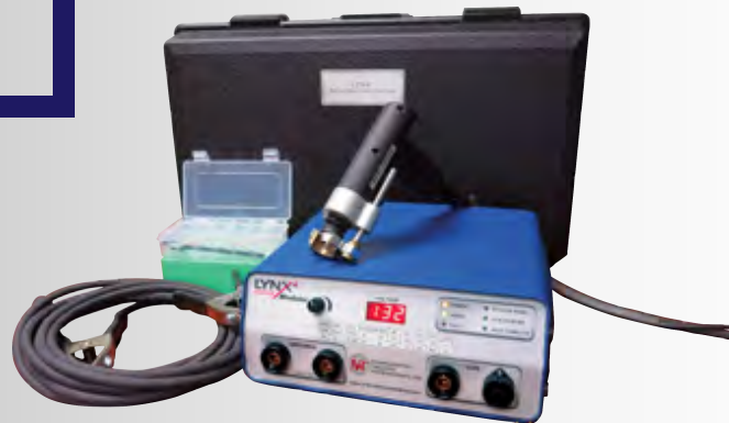
Complete CD Stud & Arc Stud Welding Systems