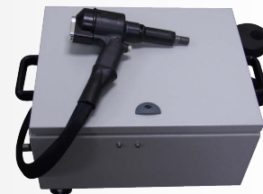
Rivet Nut Installation Tools