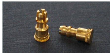
Manufactured by Captive Fastener Corp