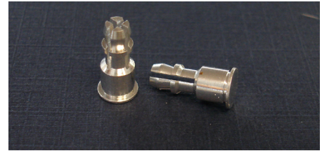
Manufactured by Captive Fastener Corp