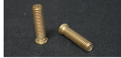
Manufactured by Captive Fastener Corp

SERIES Captive - TCH / TCHS PEM® - TFH / TFHS JHP Fasteners - SFHT