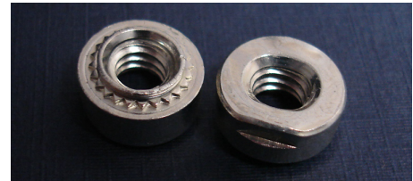
Self-Locking Shown Manufactured by Captive Fastener Corp

Captive - CFH, CFHN & CFHNL PEM® - H, HN & HNL JHP Fasteners - SCH & SCHL