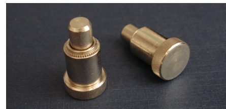
Manufactured by Captive Fastener Corp