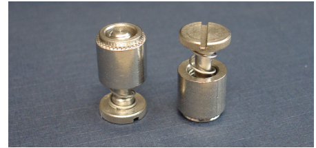
Manufactured by Captive Fastener Corp

SERIES Captive - CPFC2 PEM® - PFC2 JHP Fasteners - PF