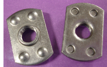
JPQNM Series - Tab weld nut with 4 precision pilot locations. Made from a high-welding quality low carbon steel.