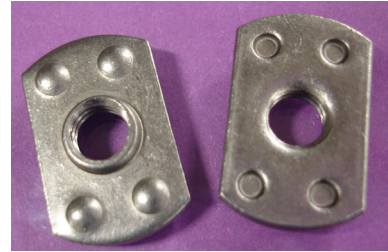
JPQNZ Series - Tab weld nut with 4 precision pilot locations. Made from 18-8 stainless steel.