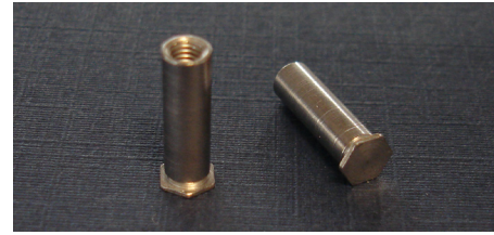
Manufactured by Captive Fastener Corp