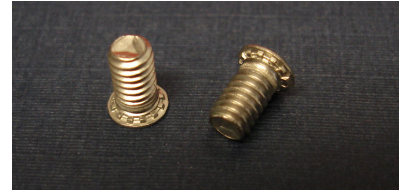
Manufactured by Captive Fastener Corp

SERIES Captive - CHTS PEM® - FH4 JHP Fasteners - SFH_C4